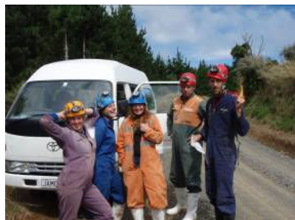
Staff training—Caving at Mahoenui, Totoro Road caves

This term the focus of learning has been on kayaking and rafting skills as well as the core operations of TOPEC as an Outdoor Centre.